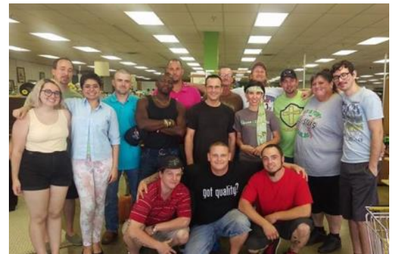
Volunteers and staff pose for a picture at our Gifts of Grace Resale Store in Longview.