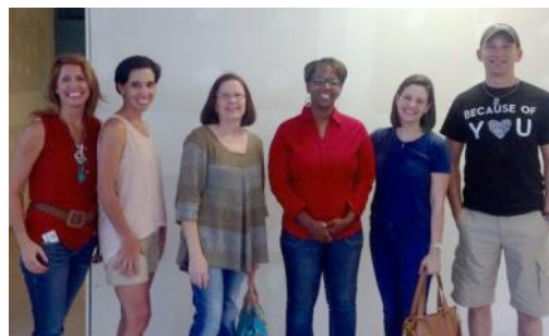
Representatives from Texoma Health Foundation toured House of Disciples-Mission Texoma to see their grant dollars at work.

Visit our iTunes page where you can download one song or the whole album.